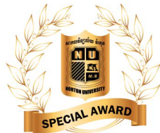
SPECIAL AWARD FROM NORTON UNIVERSITY

THE INTERNATIONAL ENGINEERING INVENTION INNOVATION EXHIBITION 2018