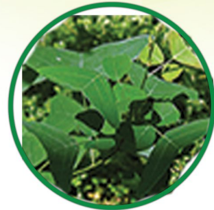
SWALLOWTAIL BUTTERFLY PLANT