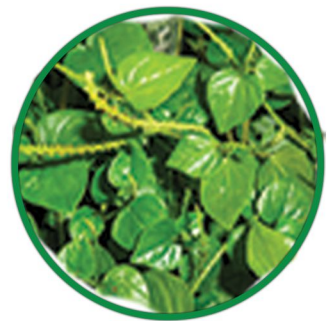
CRAB CLAW HERB