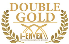
DOUBLE GOLD AWARD

THE INTERNATIONAL ENGINEERING INVENTION INNOVATION EXHIBITION 2018