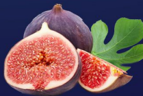
FIG EXTRACT Help to maintain cholesterol level

OLIVE EXTRACT Help to control high blood pressure